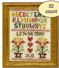
Hearts & Flowers