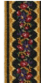
Berlin Woolwork § 2 ins (5 cm) Kit £20.95 Chart £10.50