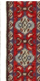
Amy (red) 2 ins (5 cm) Kit £20.95 Chart £10.50