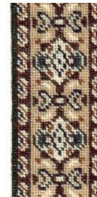
Amy (beige) 2 ins (5 cm) Kit £20.95 Chart £10.50