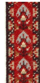
Yvonne (red) § 1.75 ins (4.5 cm) Kit £20.95 Chart £10.50