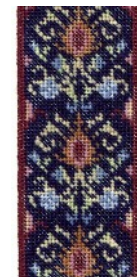
May (blue) § 1.85 ins (4.7 cm) Kit £20.95 Chart £10.50