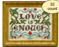
Love Is Enough