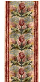
Bella § 1.75 ins (4.5 cm) Kit £20.95 Chart £10.50