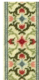
Carole (pastel) § 2 ins (5 cm) Kit £20.95 Chart £10.50