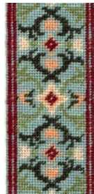
Carole (jade) § 2 ins (5 cm) Kit £20.95 Chart £10.50