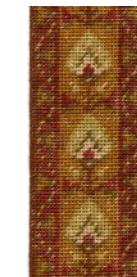
Yvonne (olive) § 1.8 ins (4.7 cm) Kit £20.95 Chart £10.50