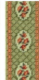
Barbara (green) § 1.85 ins (4.7 cm) Kit £20.95 Chart £10.50