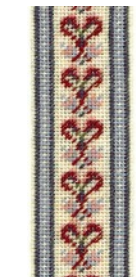
Sophie § 1.5 ins (3.8 cm) Kit £19.95 Chart £9.95