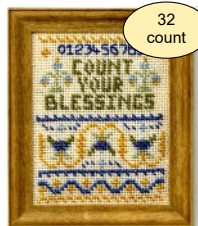
Count Your Blessings