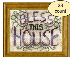
Bless This House