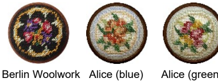
Berlin Woolwork Alice (blue) Alice (green)

These kits contain a colour block chart, instructions, stranded cotton, needle and 28 count fabric, as well as a mount for the finished stitching. The turned mahogany parts to make up the wooden base are included - a mahogany wax finishing pack is available separately for £5.50 ( for details see page 9), to polish the base after it is glued together. All of these designs co-ordinate with other items.