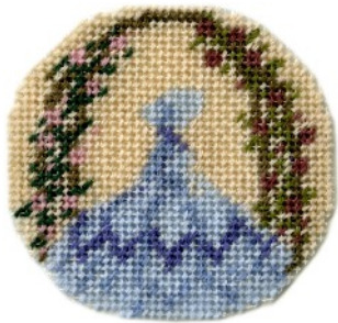
Crinoline Lady 1 3/8 inch across (3.5 cm) §