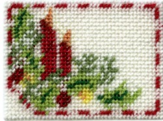
Christmas Candles 1 3/8 x 1 inch (3.3cm x 2.5cm) §