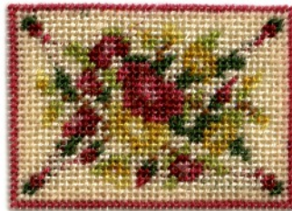
Summer Roses 1 3/8 x 1 inch (3.3cm x 2.5cm) §